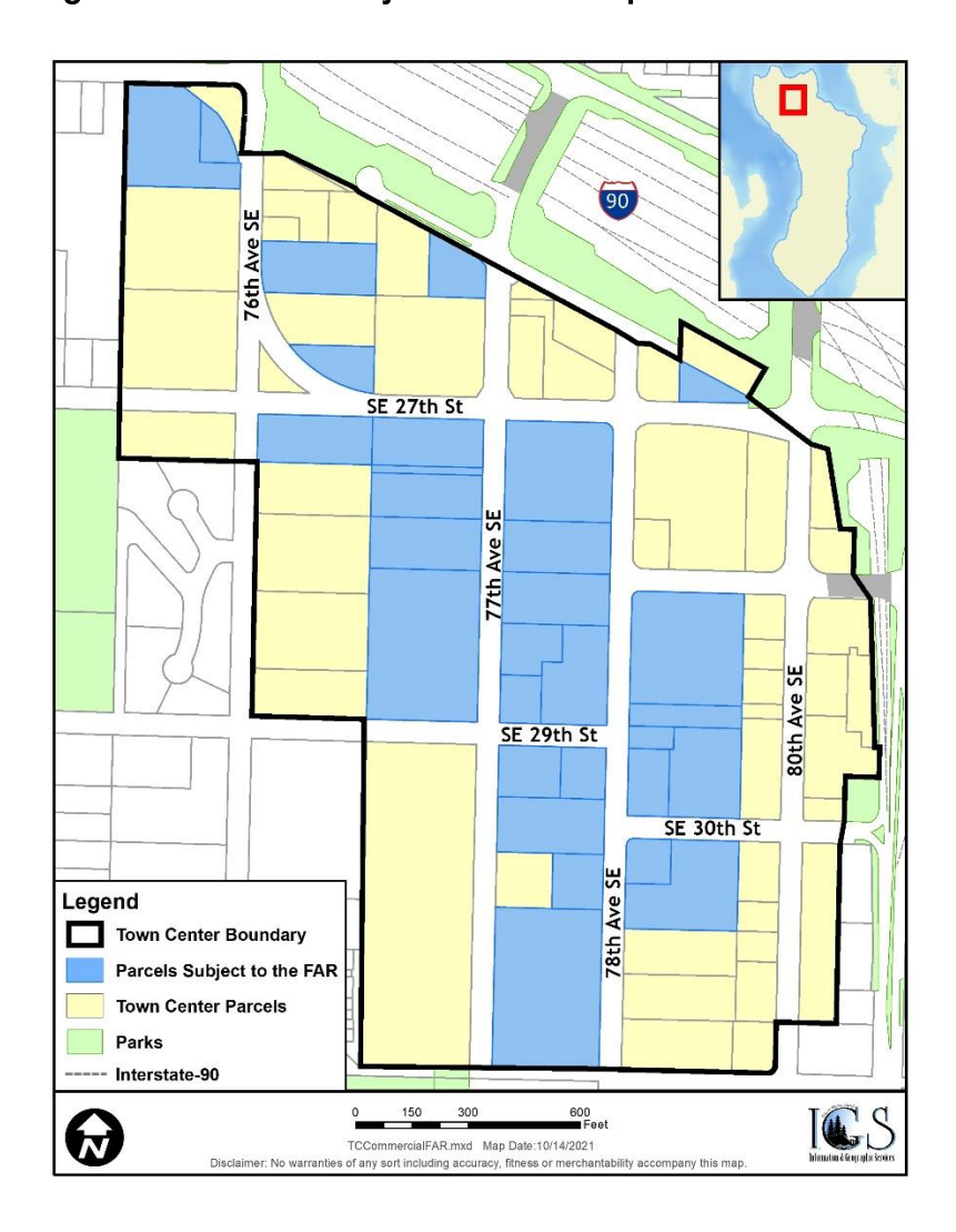
Figure 3 - Parcels Subject to FAR Requirement for Commercial Uses

* Please Note: The new language and maps below may be updated through the issuance of the October 20, 2021 regular meeting packet for the Planning Commission.